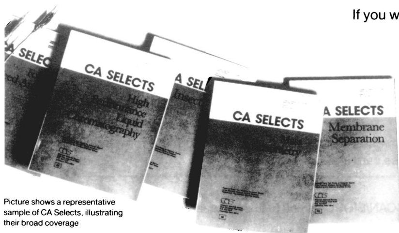
Picture shows a representative sample of CA Selects, illustrating their broad coverage

(N.B. Subscriptions run for twelve months from date of order.)